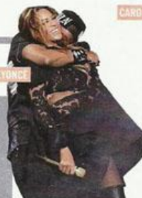
JAY Z AND BEYONCÉ