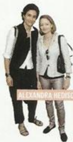
ALEXANDRA HEDISON AND JODIE FOSTER

Surprise! Six couples who skipped save-the-dates