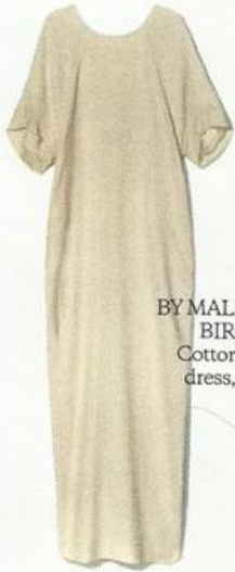
BY MALENE BIRGER Cotton-mix dress, £379