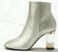
POLLINI Leather and Plexiglas boots, £564