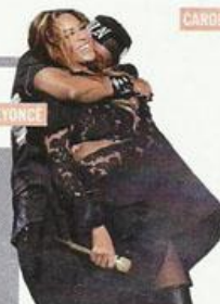
JAY Z AND BEYONCE