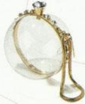
CATERINA ZANGRANDO Plexiglas, gold-plated brass and Swarovski crystal bag, £1,010