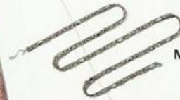
JENNY PACKHAM Grosgrain and crystal belt, £221