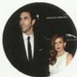
SACHA BARON COHEN AND ISLA FISHER