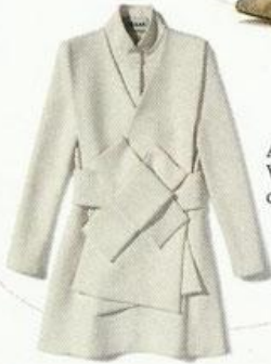
A.W.A.K.E. Wool-mix dress, £700