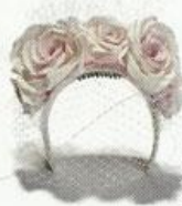
LISA TAN MILLINERY Silk and net headband, £399